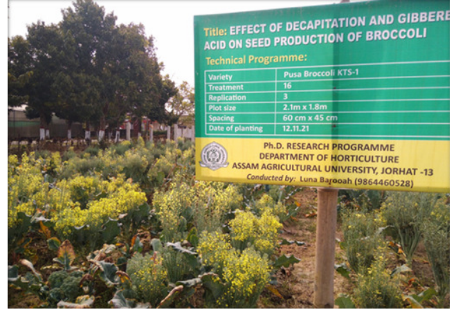
Fig. 1: Flowering stage during 2021-22