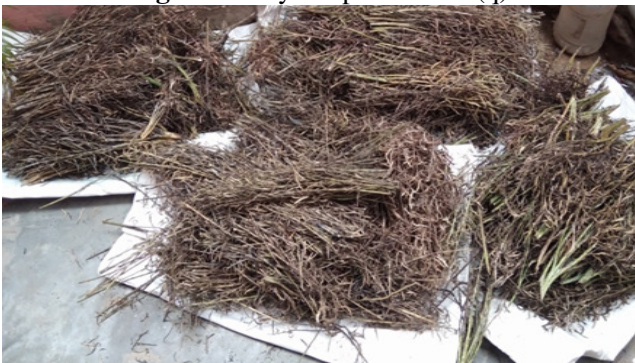
Fig. 4: Harvested pods after drying