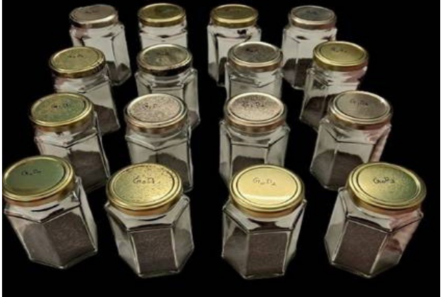
Fig. 5 : Seed storage in glass bottles